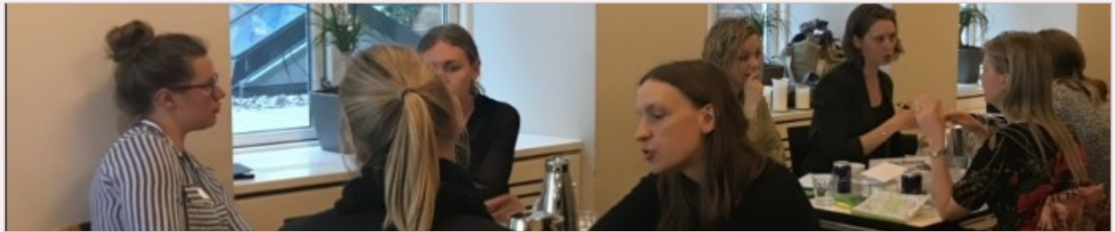
Peer conversation during a My Story masterclass

Throughout the programme, you will learn from accomplished guest speakers and facilitators from leading Nordic organisations — each sharing their authentic leadership story, hard-won insights, and practical wisdom in a candid, intimate My Story session.