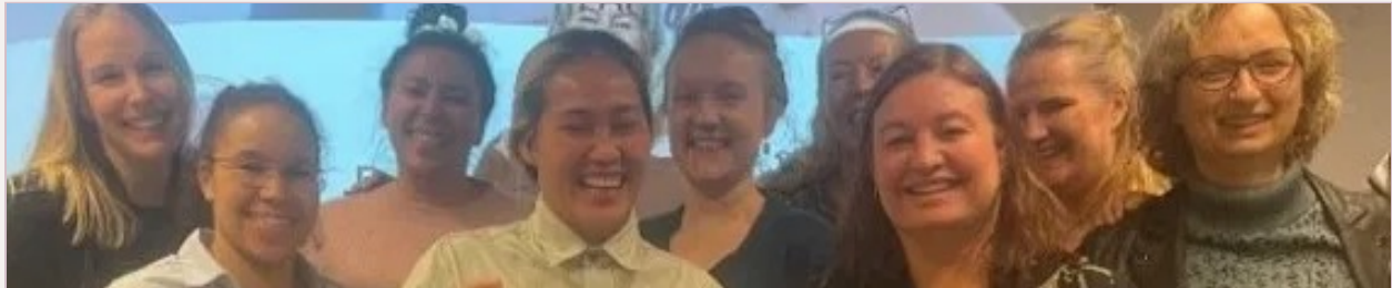
A previous Becoming an Authentic Leader cohort