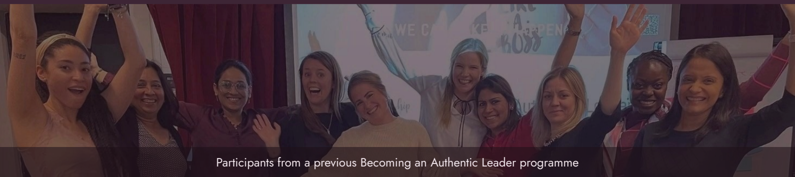
Participants from a previous Becoming an Authentic Leader programme